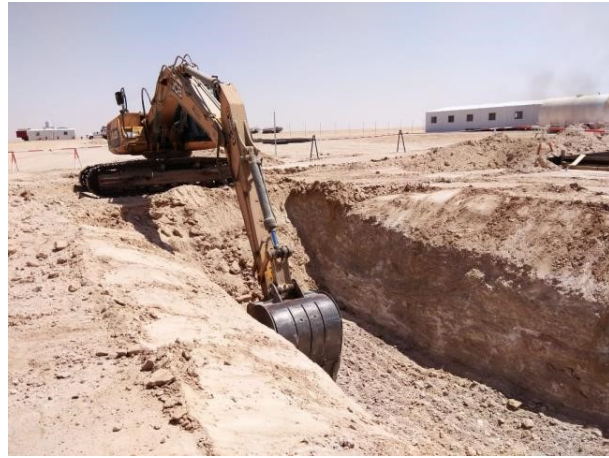
Construction of Site Offices - SSEM - YANBU – Project