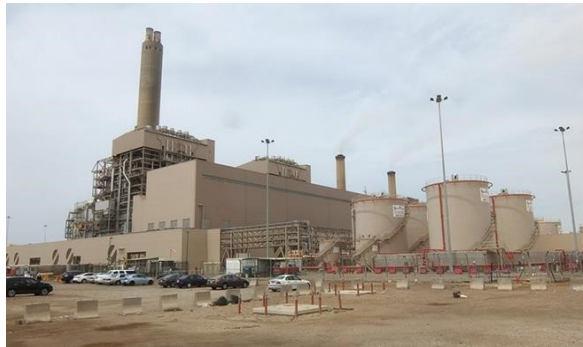
MARAFIQ 5 & 6 PLANT YANBU