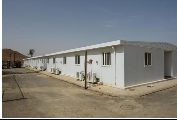
SINOPEC SITE OFFICE- YANBU