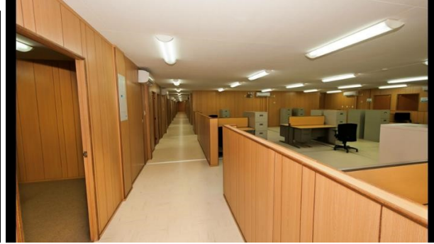
Hanwha – Maadein Gold Mining- Project. Taif.