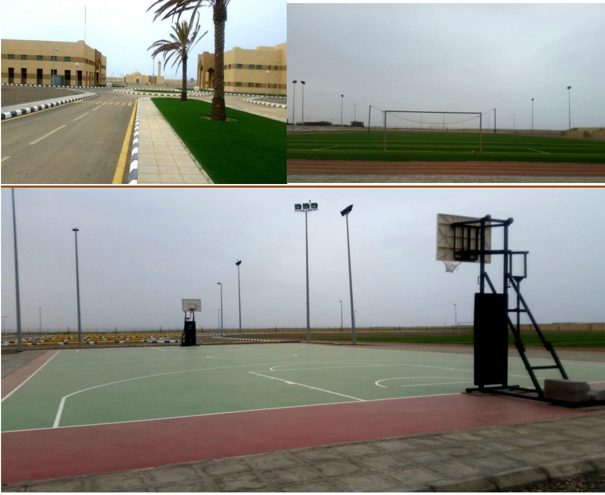
CLEAN CAMPUS AREA AND WELL MAINTAINED PLAY GROUNDS

Our systematic approach to process and systems functions and application of effective preventive and predictive maintenance tasks. We make sure our Q & M solutions are suitable to your situations by carefully working together to identify your needs.