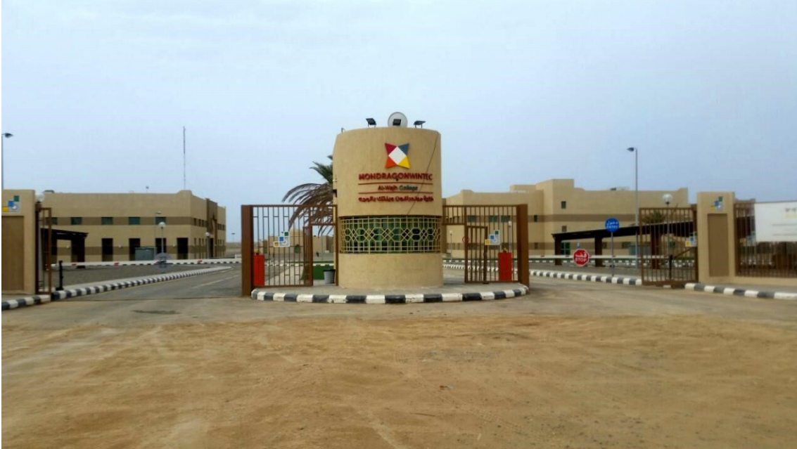
MONDRAGON WINTEC COLLEGE IN ALWEJH- SAUDI ARABIA

MASB has a team of specialists dedicated to maintaining our customers' facilities to the highest standard possible. We specialize in extending the useful life of our facilities while maximizing occupant comfort and a productive work environment. Typical operation and maintenance (O&M) service contracts include: