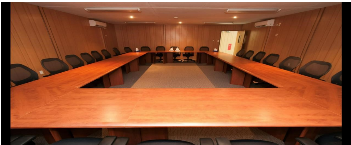
MEETING ROOM - Hanwha Marafiq 5 & 6 Project

C.R.: 470008810 Yanbu, P.O Box 349 Tel: (+966) 014 391 5984 fax www.albraikigroup.com