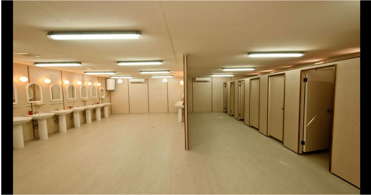
WASHROOMS in Site Offices – Hanwha Marafiq 5 & 6 Project