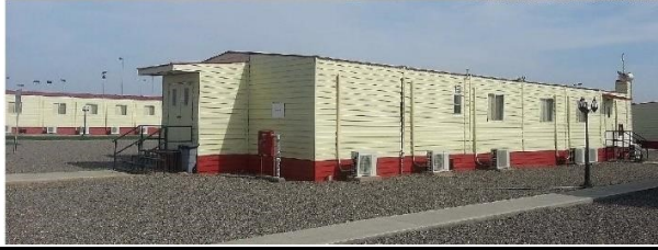
YASREF – SENIOR CAMP - YANBU